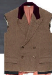
FROM TOP: GAVEL, AW19/SS20, EMILIA.WICKSTADL.COM ; DECONSTRUCTED WAISTCOAT, FW20, GLECCO.COM