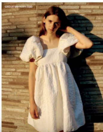
CICQUE WATSON SS20