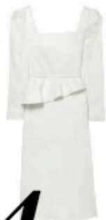
FROM LEFT: ROSA JACKIE, SS20, RIPPLE.PHOTO.COM ; RIFLE DRESS, FW19, JONASNA.DTIZ.NEVA.PORTR.COM ; DRY WHITE DRESS, FW19, MEADOWSSTORE.COM