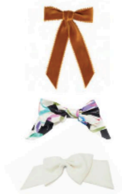
FROM TOP: COPPER KNOT? BARRETTE, FW20, JENNIFERBEH.COM ; LOKO PIN? BOW, FW20, MARK.JACOBS.COM ; LUREY TONGUE.COM WHITE DRESS, HANG-UP, FW19, EMILIA.WICKSTADL.SMITHSONIAN.COM

Cast off your combs, scarves and sliders: this summer, wedding guests and whimsical dressers alike will be accessorising with a romantic hair bow. Check out Boussergent for carefree, oversized styles, or Jennifer Behr's neat-as-a-pin barrettes.