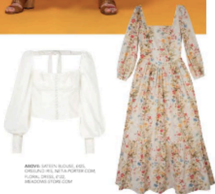
ANDYB SMITH BLOUSE, FW19, DRIFTLAND.WEBSITE.PORTR.COM ; FLORA DRESS, FW20, MEADOWSSTORE.COM

A little bit Princess Diana, a little bit Jane Austen's Emma (released last month with costumes by Alexandra Byrne) – the angular neckline du jour literally frames the face and décolleté, adding structure to billowy sleeves, gathered skirts and – dare we say it – padded shoulders. To sit snugly against the chest, get your tailor to tweak the armholes and shoulders for the perfect fit.