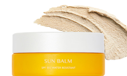
SPF 50 balm, £16 for 20ml, Tropic, tropicsskincare.com