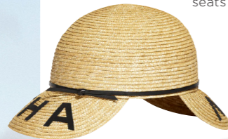
Straw cloche hat, POA, chanel.com

Make a reservation at Umami, Baglioni's Japanese restaurant, where the Indian Ocean pools beneath the best seats in the house - two overwater tables.