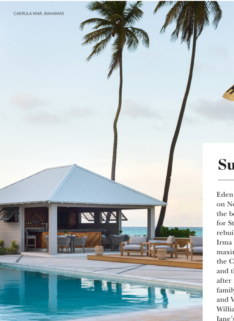
CAERULA MAR, BAHAMAS

Make a reservation at Umami, Baglioni's Japanese restaurant, where the Indian Ocean pools beneath the best seats in the house - two overwater tables.