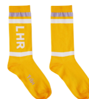
LHR airport socks, £45, Tibi, tibi.com