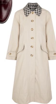
Alexa Chung's trench, designed in collaboration with Barbour, is an urban, all-weather staple. £300, harveynichols.com