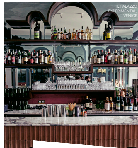
IL PALAZZO EXPERIMENTAL, VENICE