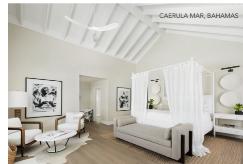
CAERULA MAR, BAHAMAS

Navigate peaks - and peak season - without the crowds at heli-lodge Niehku Mountain Villa, where the slopes of Swedish Lapland are yours for the carving. Sweden's tallest peak, Kebnekaise, is just 15 minutes away by air, and there are more than 60 other summits to choose from. The lodge itself is a log-burning, blonde-wood, Scandi skier's dream (which is what niehku means in Sami), but the purity of the powder and next-level access is what guests really go for. If you'd rather travel by sea than sky, Black Tomato has designed a ski-and-sail trip through Norway's Fjordland, travelling on a traditional schooner along the Steigen coastline, through the Lofoten Islands and finally arriving at Manshausen sea cabin. Ski peaks that are only accessible by boat along the way, and find yourself beneath the Northern Lights in the Lofotens. If old-school, good-time glamour is what you're after, Hotel Schweizerhof in Zermatt was carefully restored to its former glory by Michel Reybier (of La Réserve success) in 2018 and has once again become the uber-smart jet-set's alpine hangout. Cable cars will spirit you away to Chez Vrony for the best view of the Matterhorn. niehku.com ; blacktomato.com ; schweizerhofzermatt.ch