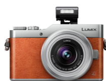
Camera DC-GX800, £299.99, Lumix, panasonic.com