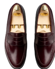
Boston loafers, £390, Crockett & Jones, crockettandjones.com