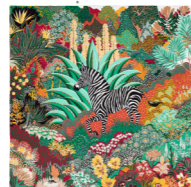
Silk scarf, £340, Hermès, hermes.com