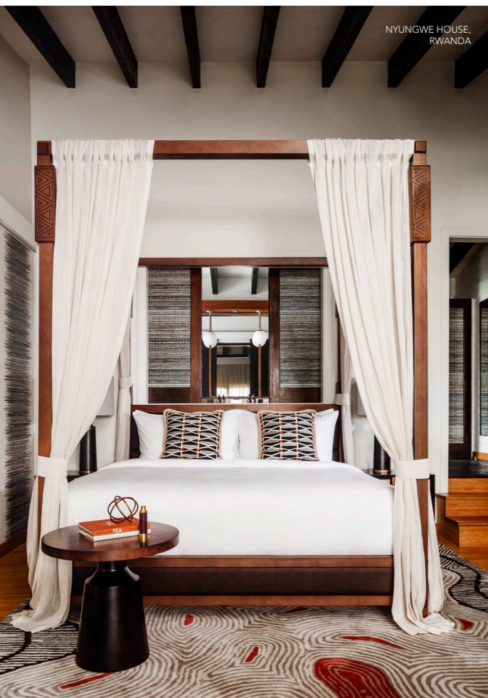
NYUNGWE HOUSE, RWANDA