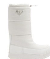
Ski boots, £890, Prada, matchesfashion.com